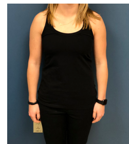
Arms relaxed at your side